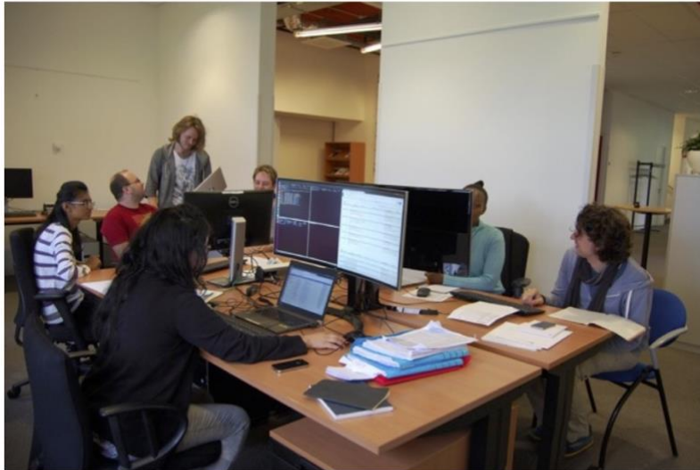
JIVE support scientists at work