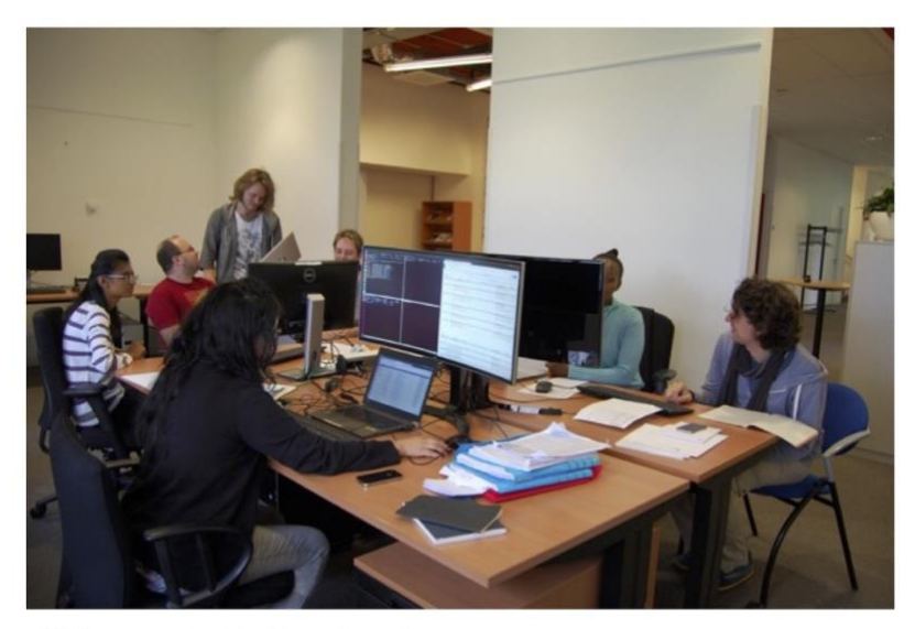
JIVE support scientists at work

See the <u>EVN Travel support</u> pages or contact campbell@jive.eu for further information.