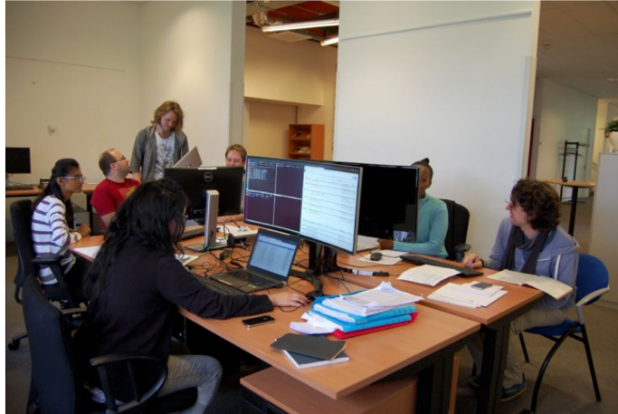
JIVE support scientists at work

Travel support to the EVN is supported, for eligible projects, by the Transnational Access programme of the RadioNet project, funded by the EC Horizon 2020 Research and Innovation Programme under grant agreement No 730562. This transnational access support, also includes travel reimbursement for visits to JIVE in order to analyse and process EVN, EVN+e-MERLIN or global VLBI Data . Further information can be found at: http://www.evlbi.org/travel-support