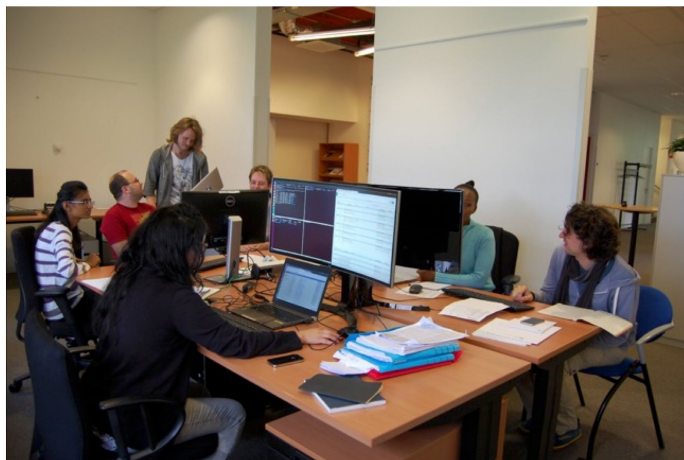
JIVE support scientists at work